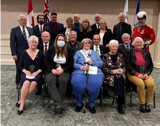
Collingwood Town Council and Order of Collingwood Recipients