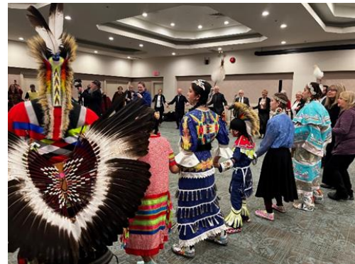
Traditional Indigenous Healing Dance