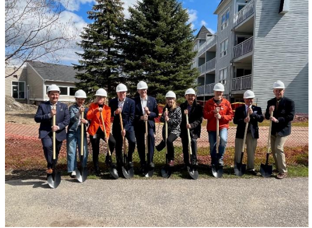
Official Ground-breaking with representatives of Living Water, Members of Collingwood Council and Staff, MP Dowdall & MPP Saunderson

Living Water Resorts has launched an ambitious vision to introduce the Living Water Retirement Residence in its Collingwood resort setting. MP Dowdall was happy to be in attendance for the Ground-Breaking. The existing resort property at Keith Avenue and Highway 26 in Collingwood, will feature 129 new rental units dedicated to seniors and retirees. In addition, the transformation includes 13,000 square feet of amenity space, including dining, lounges and fitness facilities to be used exclusively by Living Water Retirement Home residents. Completion is anticipated in the summer of 2024.