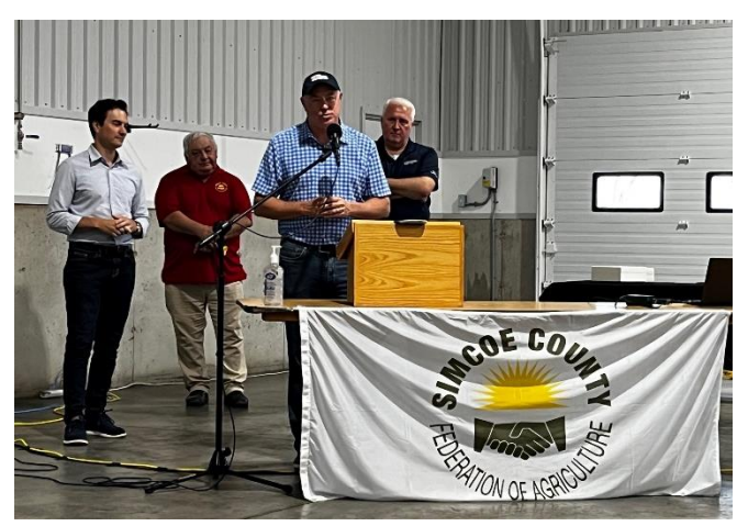
Pictured above: MP Dowdall bringing greetings to the event attendees on behalf of the Federal Government.