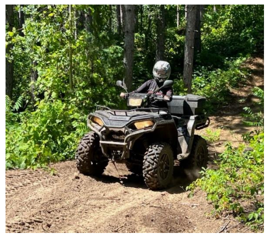
Pictured above: MP Dowdall's wife Colleen, supporting the ATV Tour.