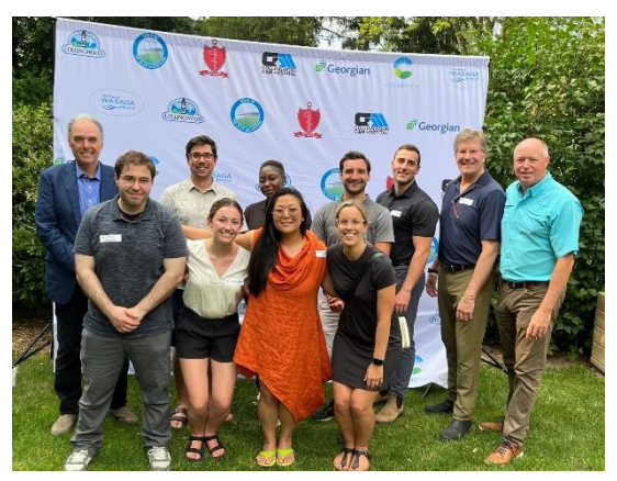
Pictured above: 2023 New Resident Doctors