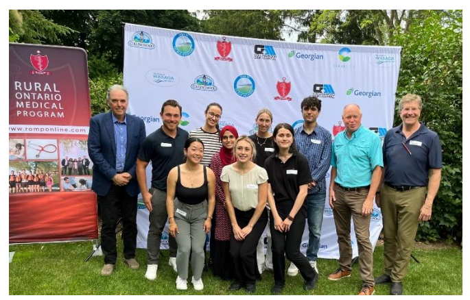
Pictured above: 2022 Returning Resident Doctors

It was a busy day at the Annual Simcoe County Federation of Agriculture Summer Barbecue. A large group toured many of the leading establishments in farming here in Simcoe—Grey! Tours included Beattie Potato Farm, Beattie Distilleries, Ontario Potato Distributing and FS Partners Grain Storage, where we received informative information on their operations and challenges of each of the establishments. Following the tour, attendees returned to the Beattie Farm for a fantastic lunch. Thank you to all Farmers, Producers and Processors here in Simcoe—Grey for all you do everyday, rain or shine to feed Canadian families with quality food!