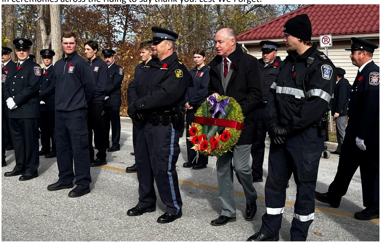
Wasaga Beach Remembrance Day Ceremony

We owe so much to our Veterans – past and present – for the sacrifices they make. As a member on the Standing Committee of Veterans Affairs, I was even more proud than usual to participate in ceremonies across the riding to say thank you. Lest We Forget.