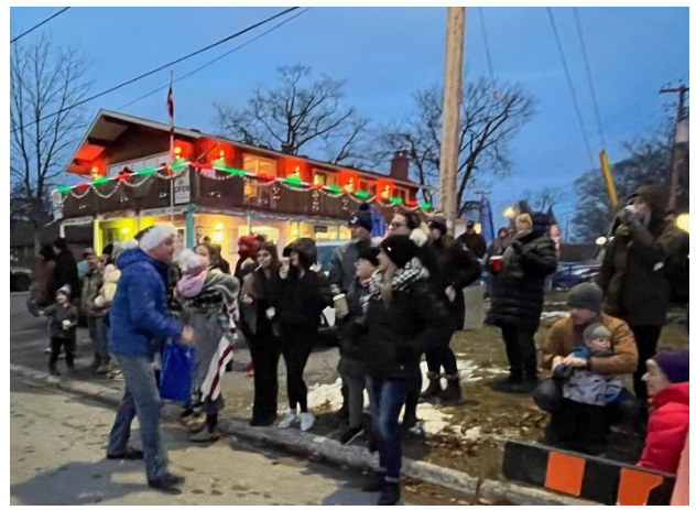
Wasaga Beach Santa Parade