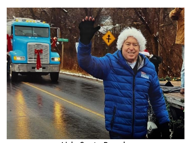
Lisle Santa Parade