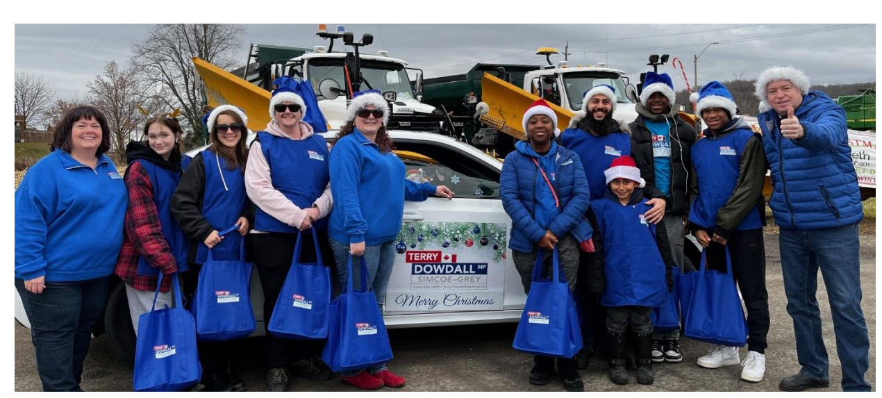
Beeton Santa Parade