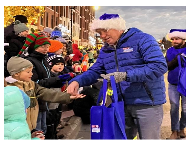
Collingwood Santa Parade