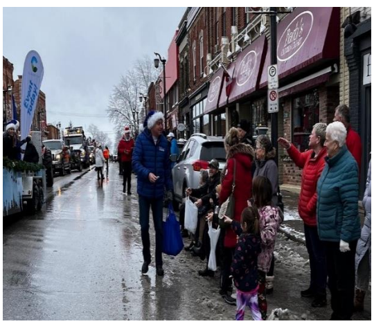
Stayner Santa Parade