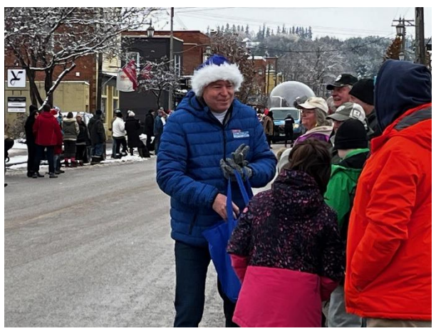
Creemore Santa Parade