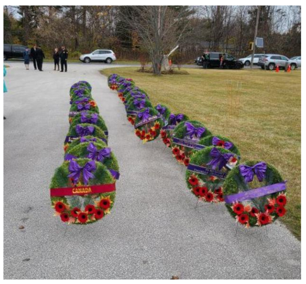
New Lowell Ceremony represented by