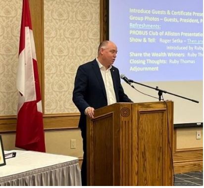
MP Dowdall addresses Probus Members.