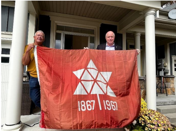
Beck Street Medical Clinic Grand Opening